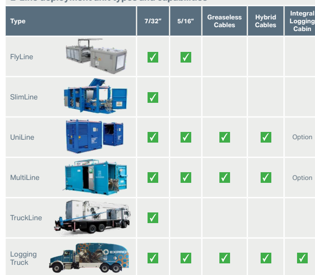
E-Line deployment unit types and capabilities

A key strength of Expro is our global fleet of deployment units - from compact, lightweight systems designed for the smallest offshore platforms to land-based logging trucks, giving operators maximum flexibility and efficiency in tailoring the E-Line intervention to the task at hand.